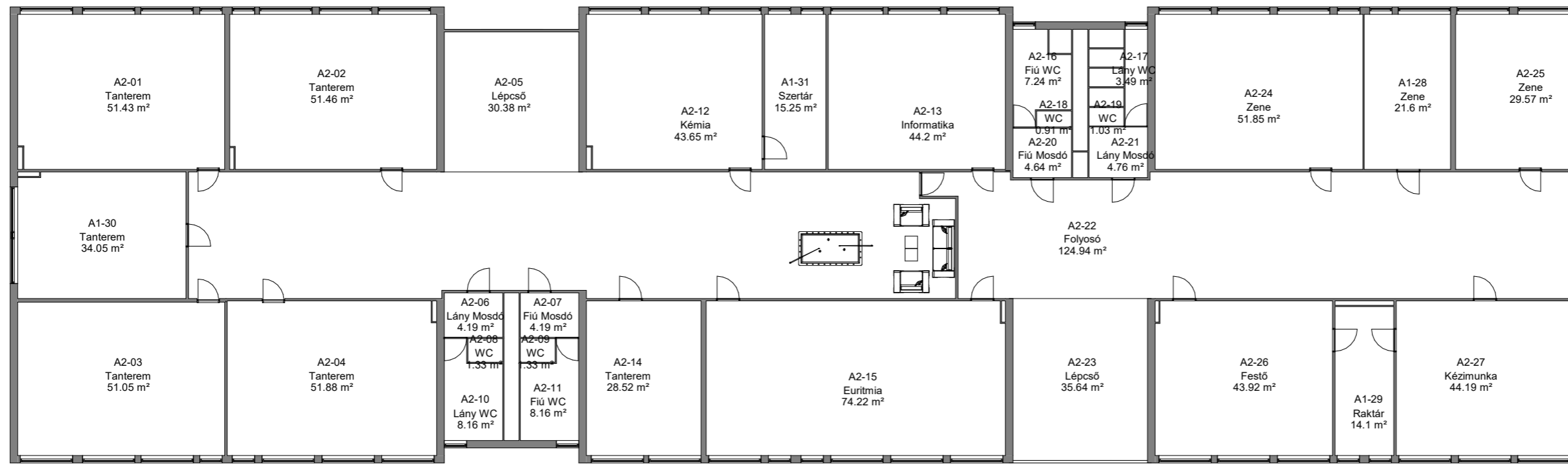
03 2nd Floor 1 : 100